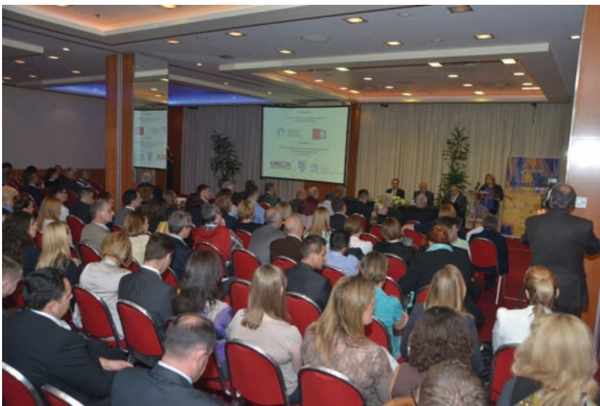
Picture 1. Opening of the conference Management and the participants

Management , a scientific and professional conference with international participation was held in Zagreb on 6 and 7 June 2014. The main topic of the conference was Economics, Culture and Communications in Projects.