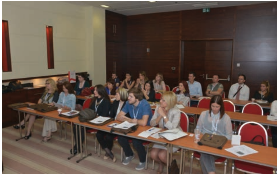
Picture 2. Participants of the workshop for young project managers organised by the Baltazar Adam Krčelić College, Croatian Association for Project Management and YCC