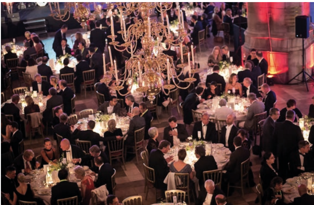
Award Gala evening at Laurens Church, Rotterdam. 30th September 2014

Winners of IPMA Project Excellence Award 2014 were announced on 30 September 2014 at the 28th IPMA World Congress in Rotterdam, the Netherlands.