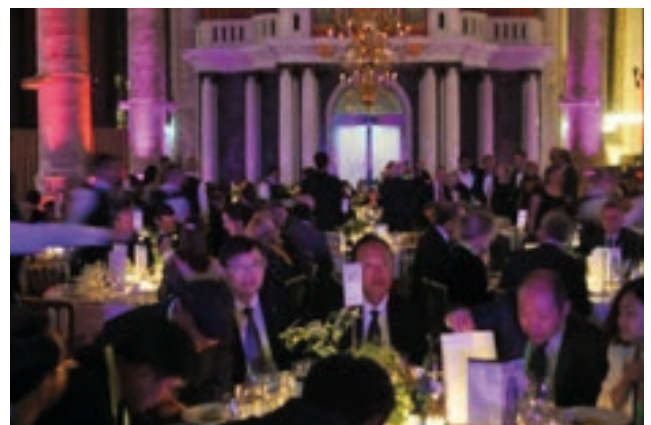
Award Gala in Laurens Church in Rotterdam